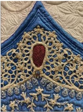
Vintage Lacy Challenge details