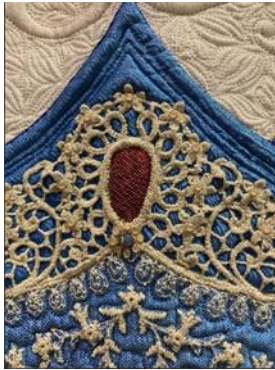
Vintage Lacy Challenge details