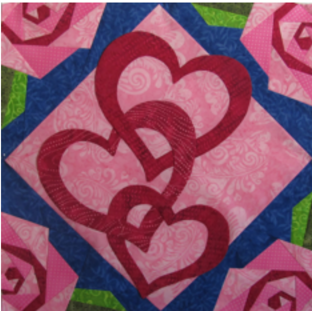
"Chain of Love" Free Pattern HERE