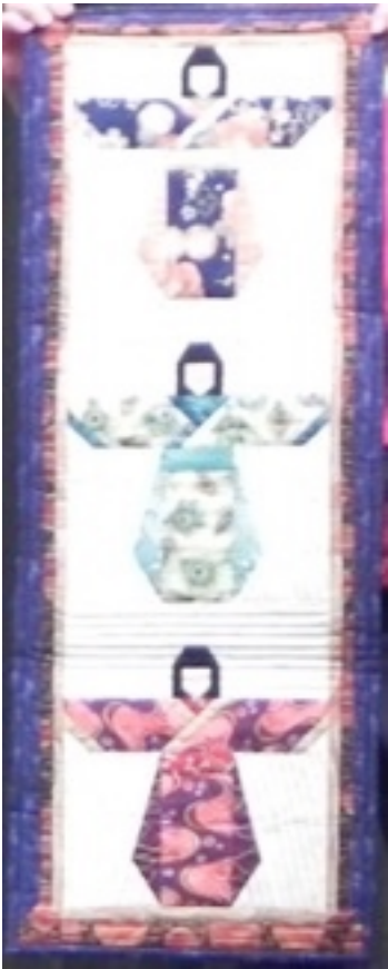
Kathy Herbach's wall hanging