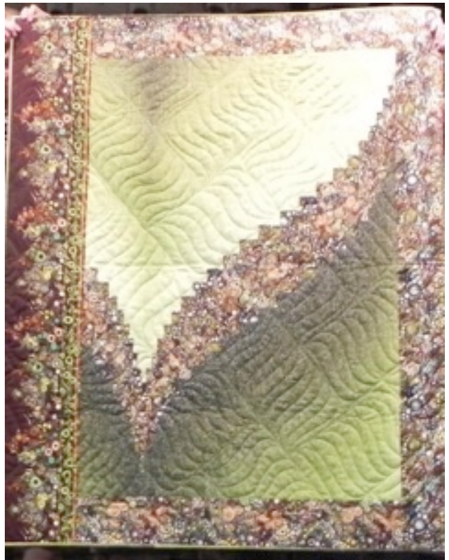
Kathy Herbach's 2 fabric lap-sized quilt.